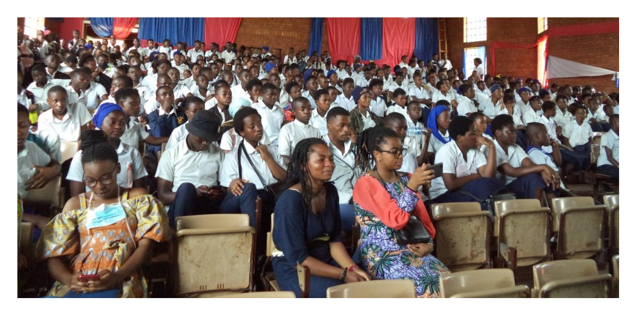
Meeting in Bukavu (DRC) from 7 to 8 March 2022

The training module for students who are members of peace clubs consists of the following chapters: