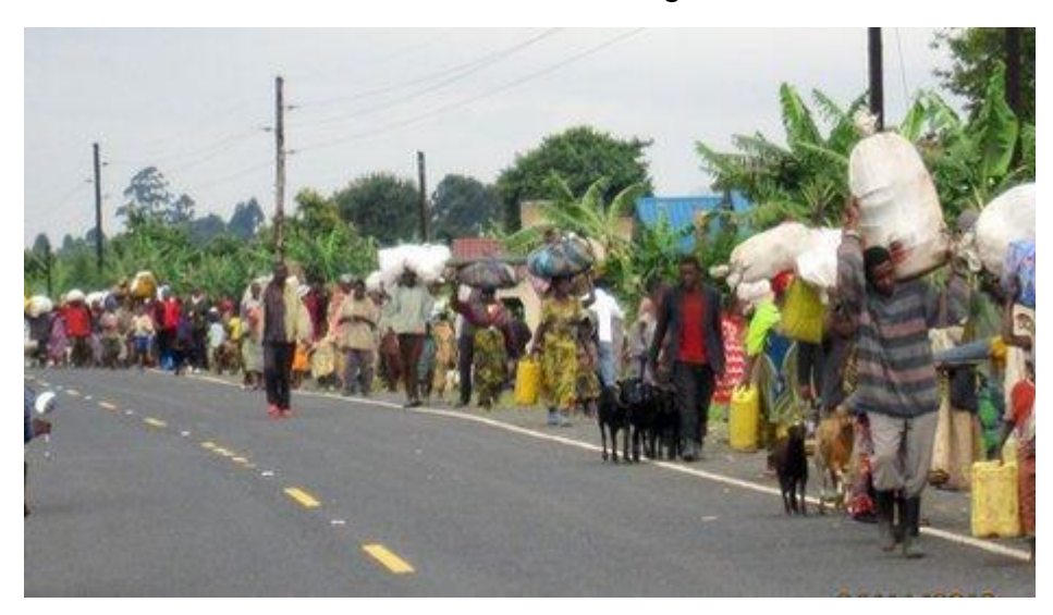
Thousands of Congolese fleeing to Uganda on 4 November 2013 / Photo by Ignatius Bahizi/BBC

The consequences of these conflicts are manifold: loss of life, disruption of infrastructure, flight and displacement of populations, bankruptcy of economic enterprises, trauma of all kinds and other misfortunes. Border-crossing tender trade is often disrupted by the temporary closure of borders and the political interests of countries. However, the people in these Great Lakes countries have populations that are related to each other, share the same culture and language, and trade a lot among themselves. All these assets do not yet contribute to the pacification of the region. They unfortunately cause mistrust and prejudice, which are the source of cross-border conflicts. The Great Lakes countries accuse each other of supporting rebel movements that destabilise their neighbours.